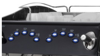
Cup tray with large capacity and detailed cup rail