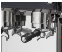
Components of the highest quality

as standard, all models in the Rosetta range have a large steam tank. The machines with a display are also equipped with an advanced PID sensor system so that the water always keeps an exact brewing temperature. The temperature is continuously monitored and is rapidly adjusted if it changes.